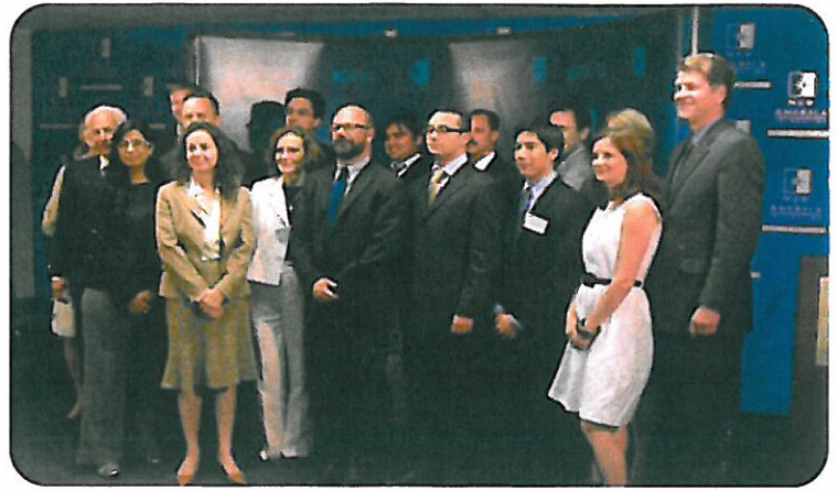
TN2020 at the New America Foundation, Washington DC, USA

At the end of October 2008, the first 100 members of TN2020 participated in the programme's inaugural summit. During this week-long gathering, all met with Ireland's President, Mary McAleese. One of her major platforms was that of African immigrants. I am happy to be a member of such an effort. I hope that the world will see not only the new U.S. President and his counterparts determine the bridge, but the citizens who will actually have to walk across it.